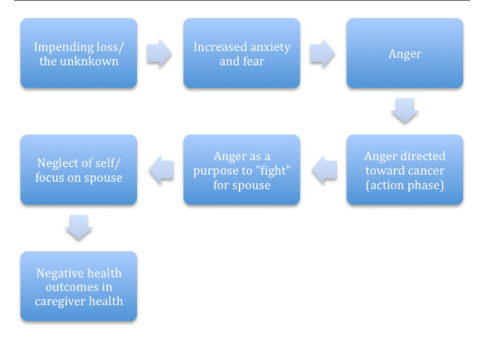
Fig. 1 Process of health outcomes for current spousal caregiver